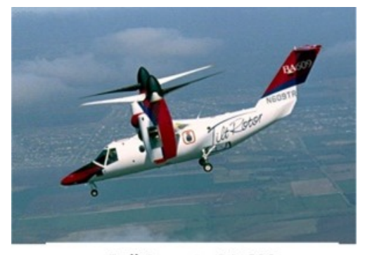
Bell Augusta BA-609

The tilt-rotor configuration is in reality a helicopter with added capability, which makes it more complicated and expensive to operate. By rotating the helicopter's rotors into a vertical rotating plane, the tilt-rotor aircraft is able to translate at approximately twice the speed of the high performance light helicopter. The purchase price of the Bell Augusta BA-609 tilt-rotor is approximately $1 million per passenger seat versus $200,000 for a high performance light helicopter like those made by Hughes.